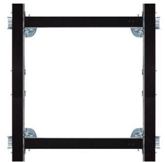
STC GRID STRUCTURE

Nominal measurements that are subject to minimal variations caused by mechanical deformation during machining.