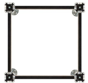
STR GRID STRUCTURE

Nominal measurements that are subject to minimal variations caused by mechanical deformation during machining.